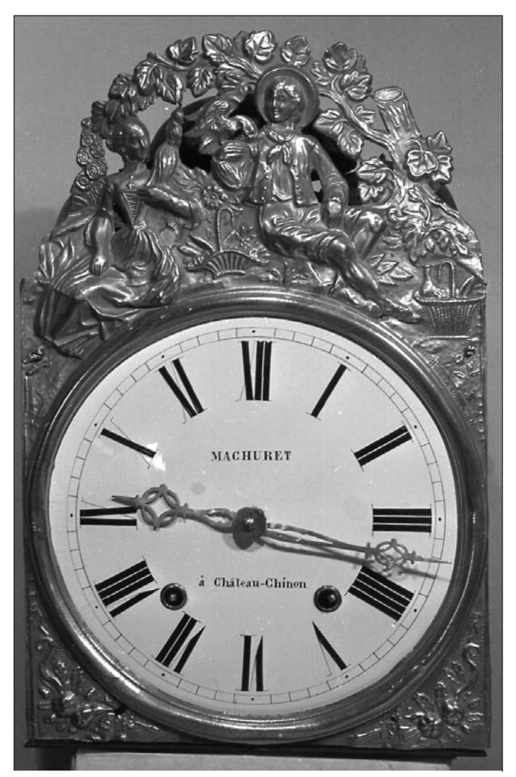
Figure 1. The classic Morbier, made in quantity from 1860 to 1915.

Figure 1 shows the typical Morbier clock of the late nine-teenth century exhibiting these external characteristics: enameled dial bearing the name of the clock merchant (not the maker) and his city, stamped brass hands and the fronton<sup>2</sup> or dial embellishment of thin repousse or embossed brass, depicting a romantic scene, usually with a rural background. Associated with such a clock was a pendulum, also of repousse brass with fanciful decoration of flowers, fruit and even animated figures (see Figure 11), and frequently painted in simple bright colors.